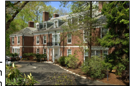
Reconstructionist Rabbinical College

Judith Kaplan became Judith Kaplan Eisenstein in 1934, when she married